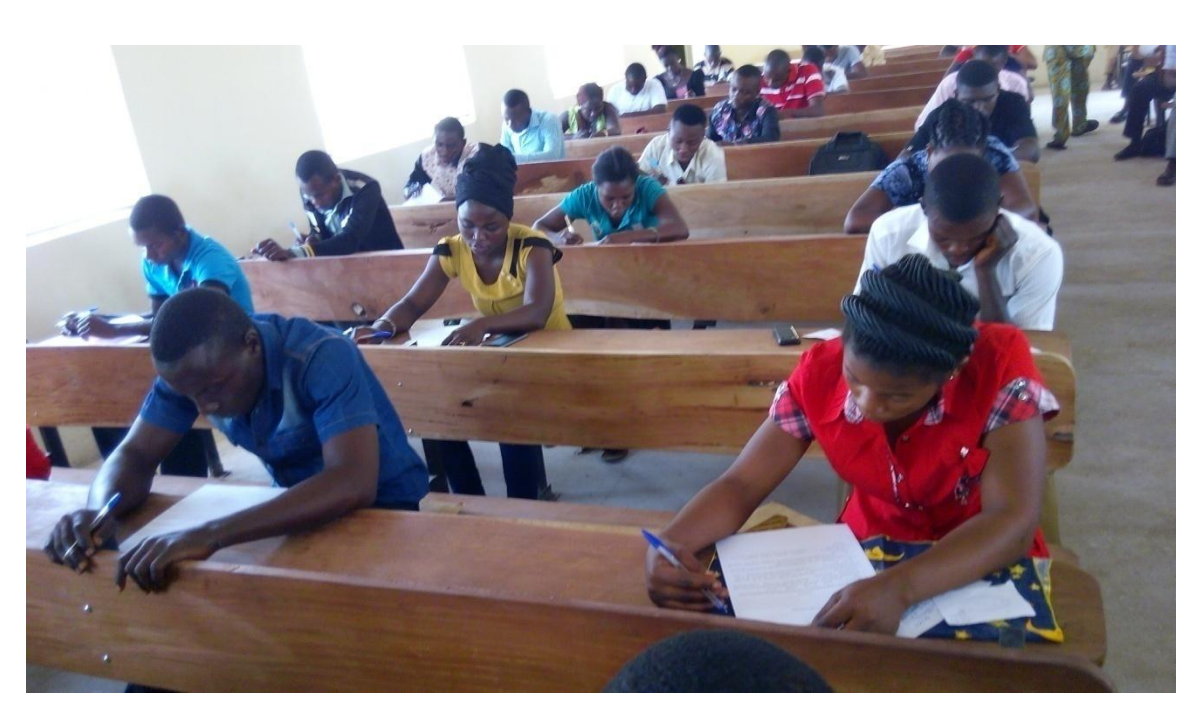
(a) AOCAY CEFTER students in examination