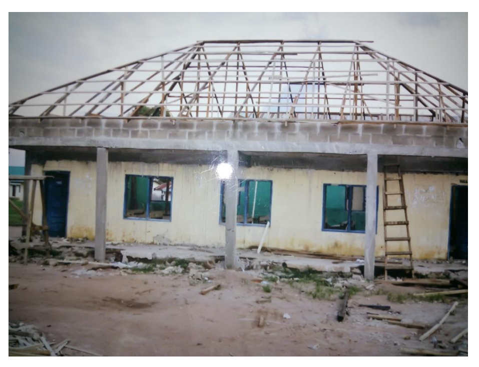
(e) Renovation of Hall 11 in progress