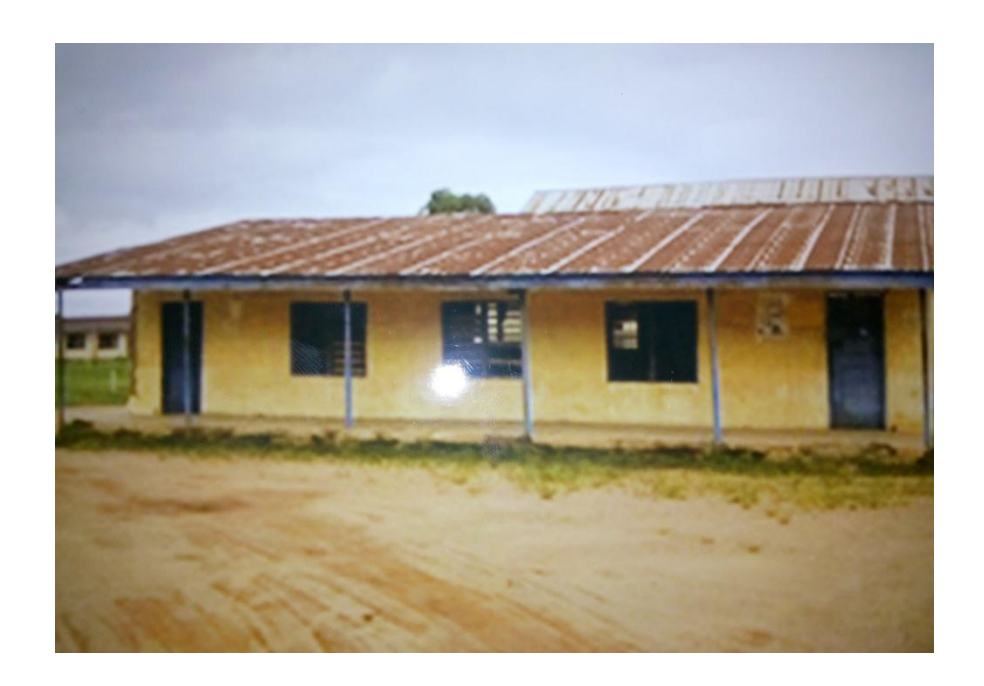
(b) Hall11 before renovation