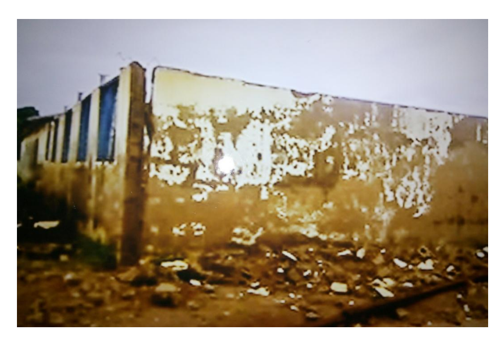
(d) Demolished Hall 11