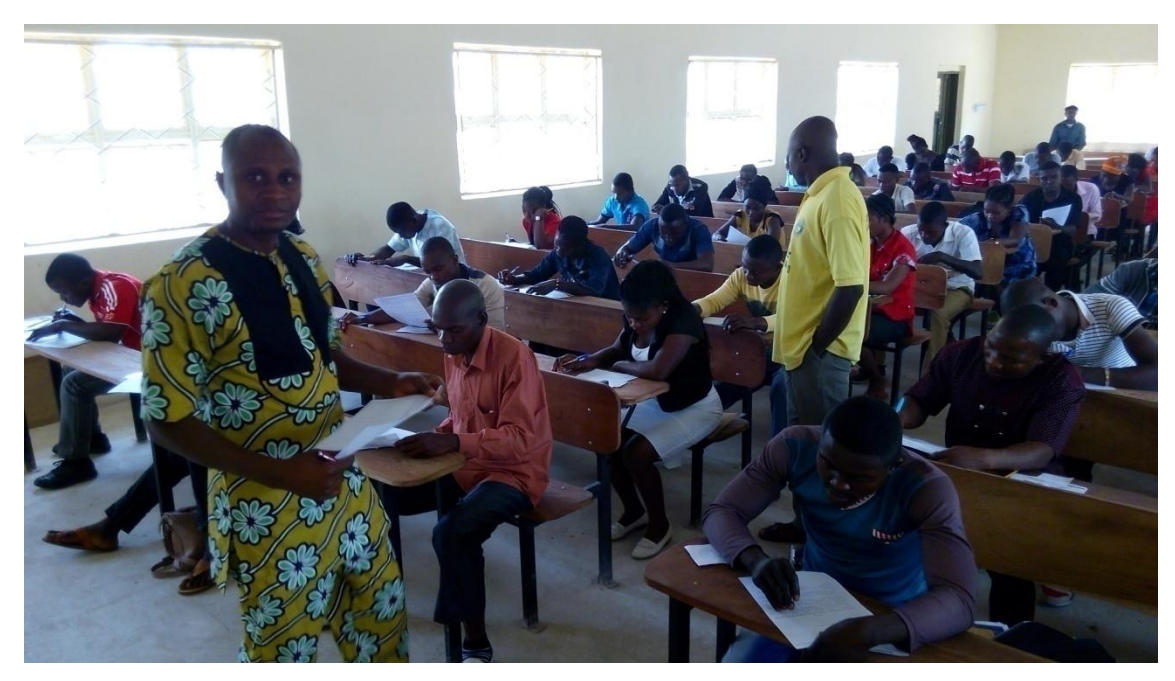
(b) AOCAY CEFTER students in examination