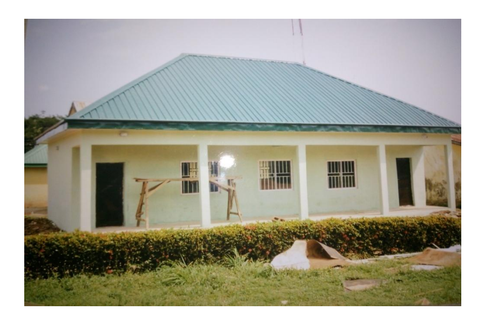
(a)Renovated hall 11