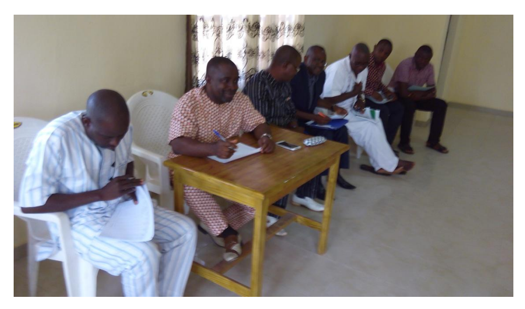
(a) Recruitment panel